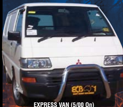
EXPRESS VAN (5/00 On) L300 SJ MODEL - 63MM NUDGE BAR Silver Ripple Powdercoated Alloy

Impact protection is just one of the benefits of these eye-catching Nudge Bars. Designed and manufactured in Australia to suit our harsh Australian conditions, these 63mm Nudge Bars are formed from high tensile alloy tubing and will never corrode or rust. Each ECB Nudge Bar is designed to suit each individual model; therefore you can be assured of an aesthetically pleasing, functional and reliable design. These 63mm Nudge Bars come complete with spotlight mounting provisions, together with a choice of polished or powder coated alloy finishes.