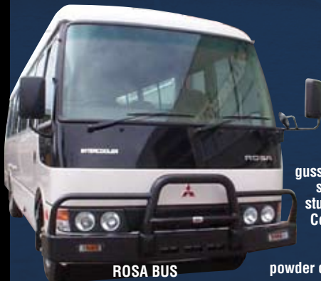
ROSA BUS BIG TUBE BAR Black Ripple Powdercoated Alloy

When you're looking for the ultimate in vehicle protection, you can depend on the rugged, no compromise reliability of the ECB Big Tube Bar. This new dimensional BTB wraps around in front of the existing front bumper bar, ensuring a neat fit and appealing design. This BTB is manufactured from high tensile, structural grade alloys and features fully gusseted 47mm headlight tubes and a one-piece bumper, while the specifically designed steel mounting system ensures a neat and sturdy fitment. Indicator/Park Light Combinations, Air Directional Cooling Vents and Driving Light Mounting Points are all standard features. To complete a great looking performance product, why not choose from ECB's range of superior, low maintenance powder coated finishes? A durable cost saving alternative to polishing.