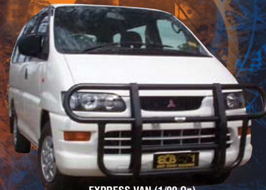
EXPRESS VAN (1/99 On) L400 WALK THRU - TYPE 7 Black Ripple Powder Coated Alloy

The Type 7 Bar contours perfectly to suit the Express Van's aerodynamic styling. Manufactured from high tensile alloys, the Type 7 Bar provides optimum frontal protection for the bumper, grille and headlights and fits sturdily with a steel mounting system. Driving light mounting provisions are standard inclusions. For a superior low maintenance finish where bugs wash off easily, why not choose from ECB's range of superior, low maintenance powder coated finishes? A durable cost saving alternative to polishing.