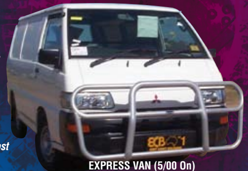
EXPRESS VAN (5/00 On) L300 SJ MODEL - TYPE 8 Bar Silver Ripple Powdercoated Alloy

The tubular construction of the Type 8 Bar contours perfectly to suit the Express Van's aerodynamic styling. Manufactured from high tensile alloys with a 63mm centre tube, the Type 8 Bar provides optimum frontal protection for the bumper, grille and headlights and fits sturdily with a steel mounting system. Driving light mounting provisions are standard inclusions and for a superior low maintenance finish where bugs wash off easily, why not choose from ECB's range of superior, low maintenance powder coated finishes? A durable cost saving alternative to polishing.