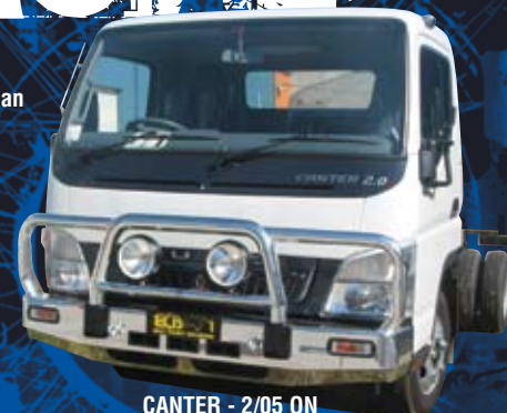
CANTER - 2/05 ON Wide Cab/ Tilt Cab 2,3 and 4 Tonne Models BIG TUBE BAR - Mirror Polished Alloy

When you're looking for the ultimate in vehicle protection, you can depend on the rugged, no compromise reliability of the ECB Big Tube Bar. This BTB is manufactured from high tensile, structural grade alloys and features fully gusseted 63mm headlight tubes. The tapered one-piece bumper incorporates a full width, braced Lower Protection Skirt and specifically designed steel mounting system ensures a neat and sturdy fitment. Indicator/Park Light Combinations, Air Directional Cooling Vents and Driving Light Mounting Points are all standard features. To complete a great looking performance product, why not choose from ECB's range of superior, low maintenance powder coated finishes? A durable cost saving alternative to polishing.